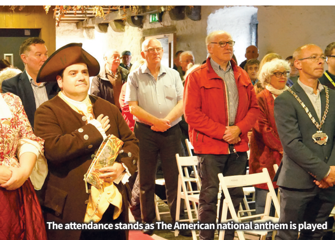
The attendance stands as The American national anthem is played