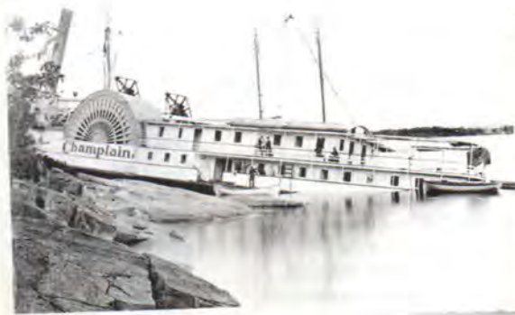
This vintage shot shows the steamboat Champlain II after its grounding on the New York shore in July 1875. Its rudder is now on display at Lake Champlain Maritime Museum, which also offers tours of the wreck site.

Rhode Island's official "Tall Ship" is also a classroom; the education-