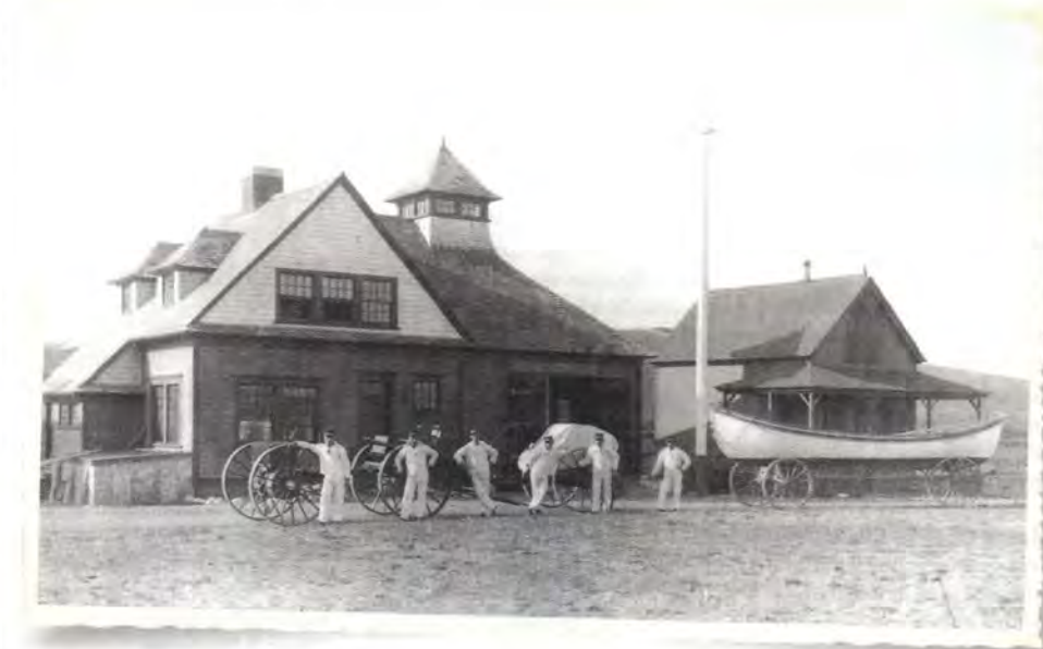
"Storm Warriors" at Point Allerton U.S. Lifesaving Station, Hull, Mass., c. 1891. Today this headquarters is home to the Hull Lifesaving Museum, featuring photo and artifact collections and hands-on exhibits on the maritime history of Boston Harbor. At right is a rescue surfboat atop a beach cart, ready to roll.

In 1839, Sengbe Pieh led a revolt aboard this slave ship that would ultimately result in the kidnapped Africans' return home; today, the re-created Amistad stands as a lesson in human rights and freedom. New Haven, CT. amistadvoyages.org