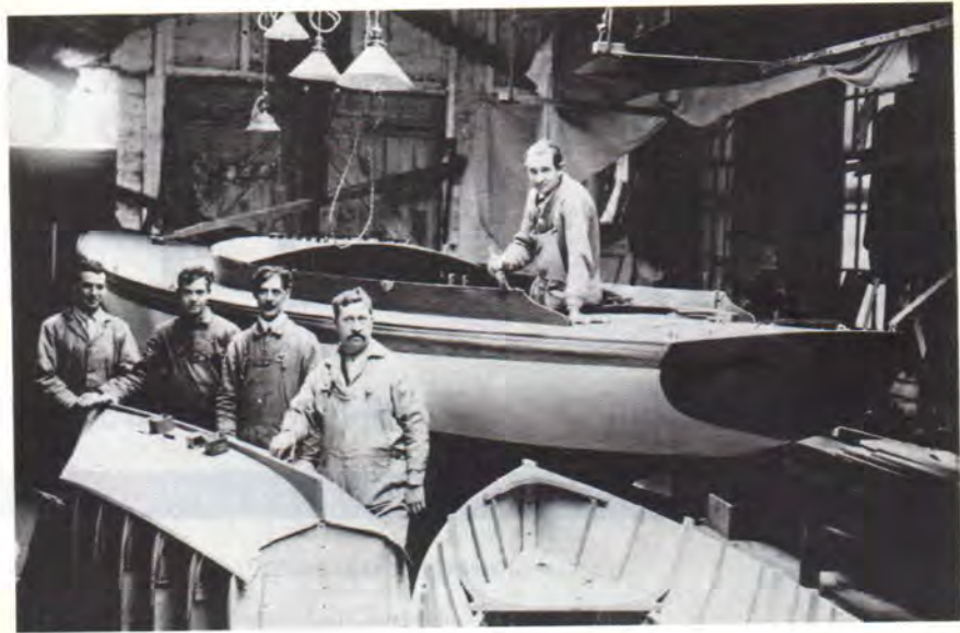
Herreshoff Marine Museum in Bristol, Rhode Island, honoring the legacy of the legendary builder of racing and cruising vessels, houses collections of yachts, models, artifacts, and vintage photos. This 1912 shot of the shop shows work on a rowboat, foreground, and on the Alerion , background, designed by Captain Nathanael Greene Herreshoff for his own use. An updated design of this classic is once again in production.

Relive the Age of Sail on three- to six-day cruises aboard one of eight