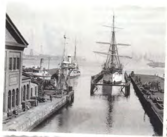
Berthed at Chalestown Navy Yard, c. 1930, was the USS Nantucket , a steamer (with auxiliary sail). A training ship from 1920 to 1944, it had served as a Navy gunboat in Asia and Central America from 1876 to 1920.

With its 17th-century English Village and Wampanoag Home-site, Plimoth Plantation lets you explore the year 1627 as it brings Pilgrim and Native American history to life. Plymouth, MA. plimoth.org